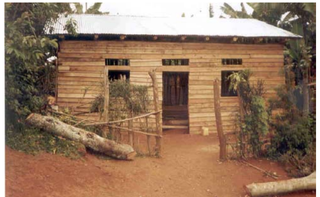
A modern house built mainly in wood with a sheet metal roof.

We would like to thank sincerely all our helpers, cleaners, sorters and donors but especially our CUSTOMERS without whom there would be nothing for the poor in Rwanda.